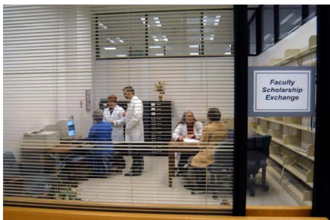
The FSE in room U114 (formerly the microfilm storage area) of the Rowland Medical Library.

This space is specifically for development of interactive research and instructional activities and is not intended as additional space for meetings or for use as a general conference room. The space may be reserved for one or more hours by groups/teams of two or more persons, one of whom must be a permanent UMC